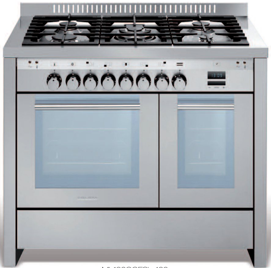
ML106GGESI - 100cm