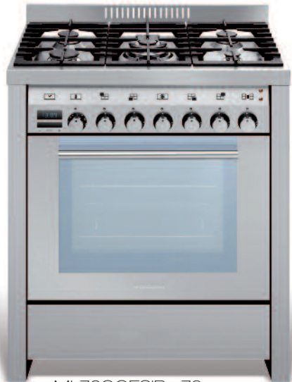
ML76GGESIB - 70cm

Freestanding Cookers • Gas hob/Bi Energy Select oven