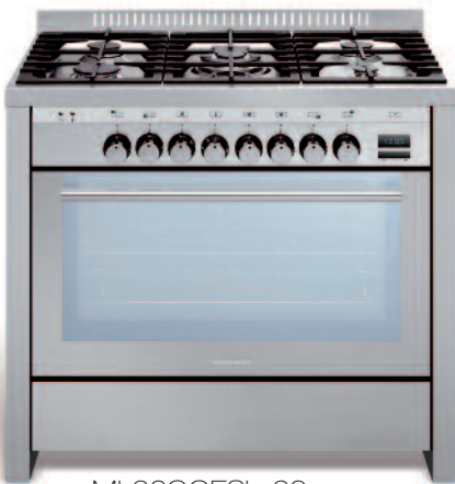
ML96GGESI - 90cm